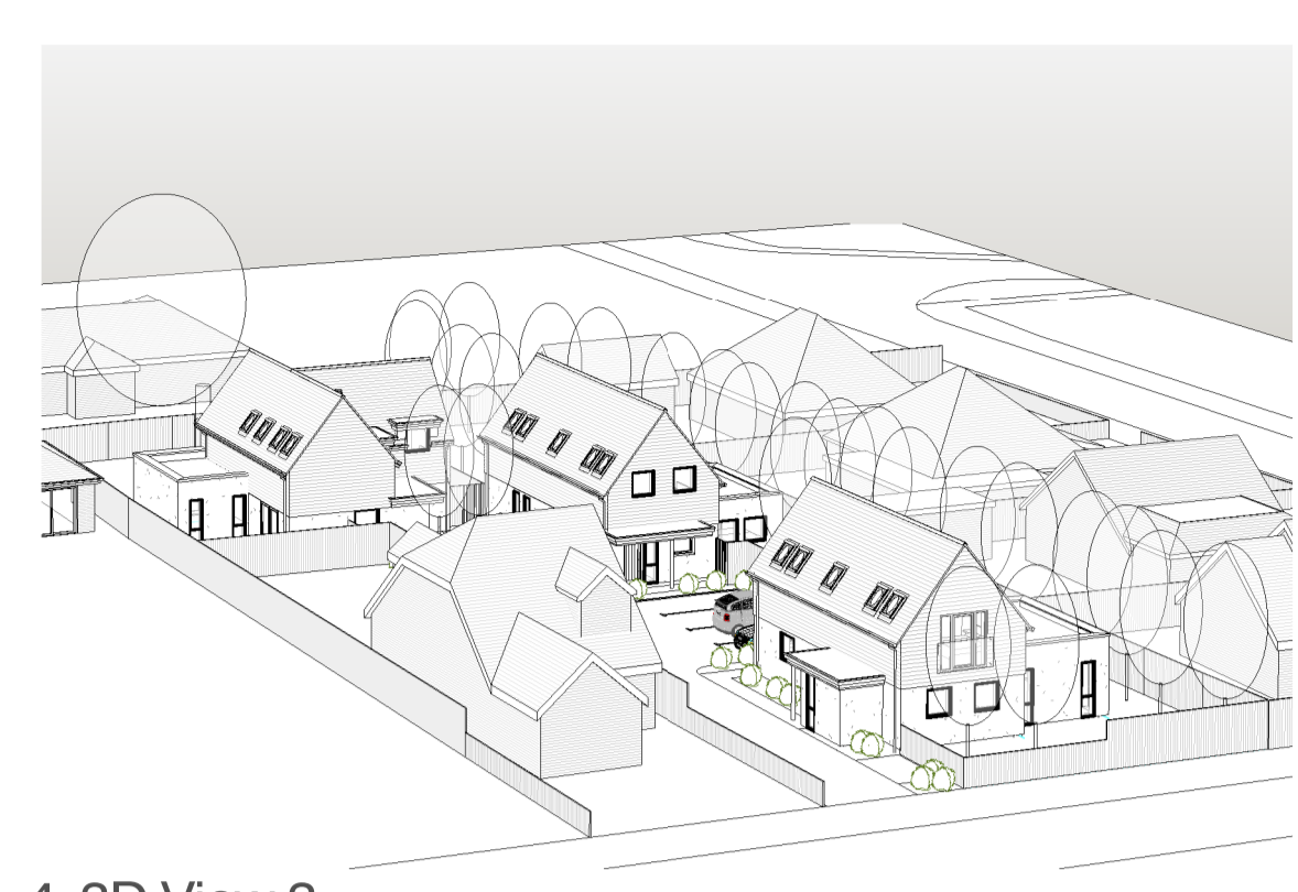
4. 3D View 3 scale