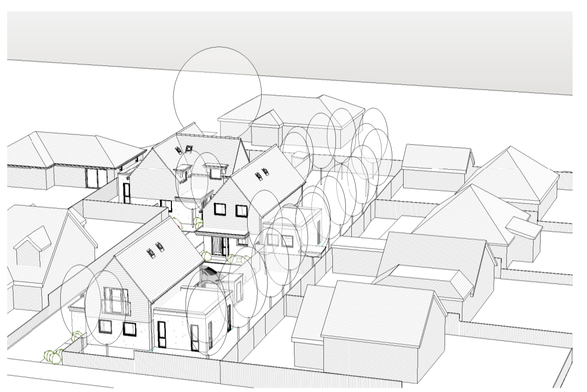
5. 3D View 4 scale