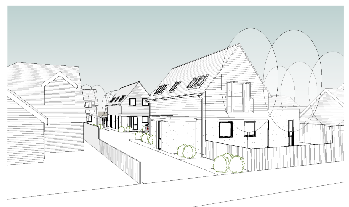
2. 3D View 1 scale